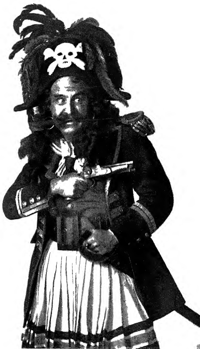
MY MAKI-UP IN "IHL PIRATTS OI PLNZANCE"